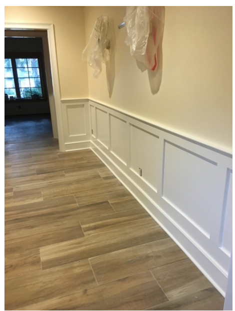
Figure 3 (finished PVC retrofit installation.)