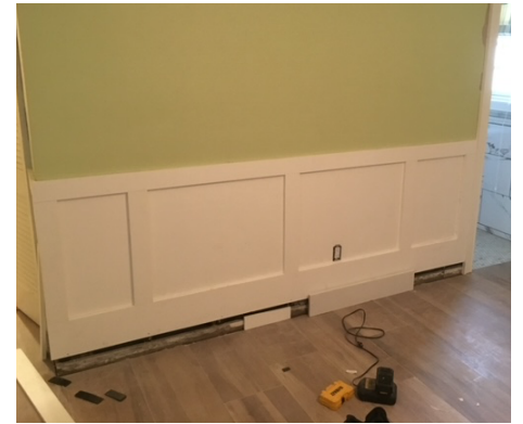
Figure 2 (PVC sheet install with baseboard prep.)

Tip: Leave the PVC Sheet Board 2 inches off of the finished floor to mitigate removal for minor flooding situations. (figure 2)