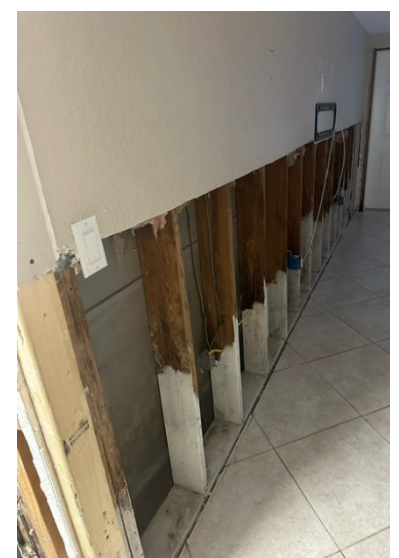
Figure 1. (4 foot drywall height removal.)